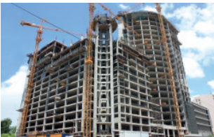
Cover: Banco de Moçambique - Maputo | Mozambique